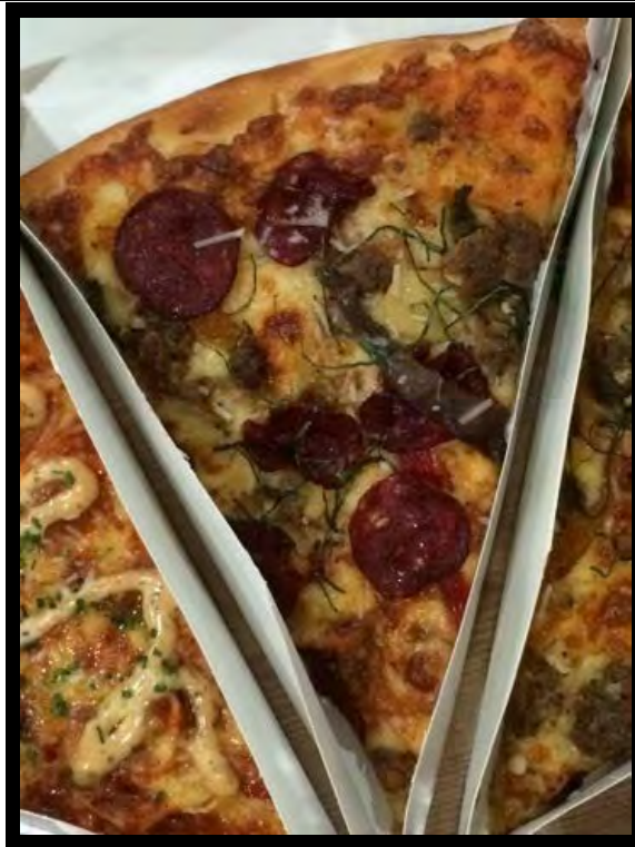
This is Tony Soprano Pizza. Sedap gila, toppings dia mmg terbaik- all toppings are in this pizza. Our favourite! Harga quite pricey dlm RM 15.88+ per slice.