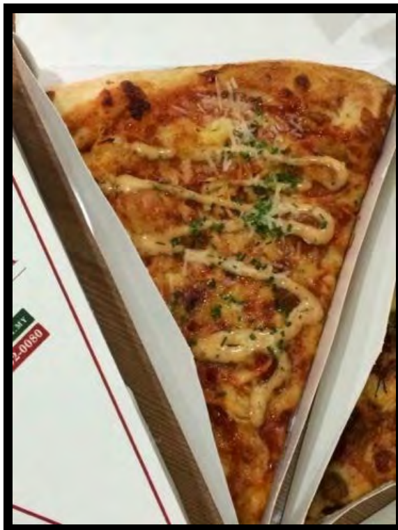
BBQ chicken pizza ni sedap dan rasa dia agak berbeza sbb diorg letak sos thousand island, menjadikan rasa bbq chicken tu unik. RM 10.88+ per slice