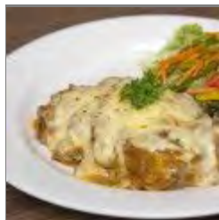
RED OLIVE @ SS2