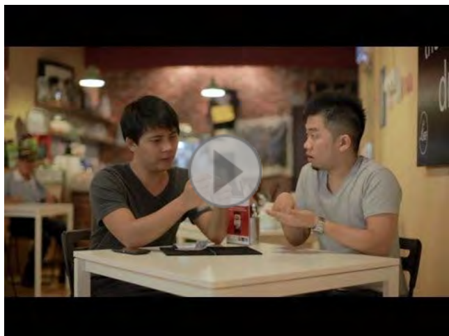
8 Types of Diners