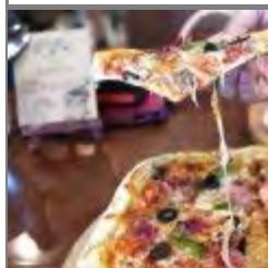
Fahrenheit 600 Café & Restaurant at