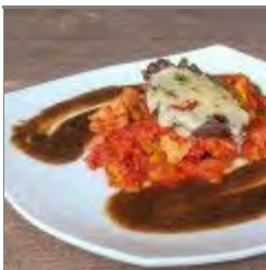
ZEST CAFE @ Bangsar South