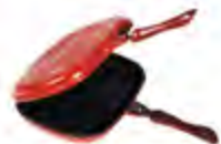
DOUBLE SIDED PAN