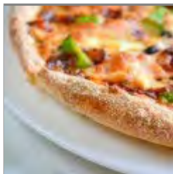
Fantastic Pizza, Panini & Choc Lava