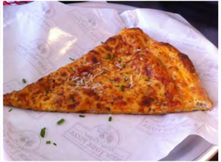
Meatball pizza on the left, and the classic New York pizza on the right

The meatball pizza was decent but the pizza Bianco ('white' in Italian) was another pleasant surprise – mozzarella, ricotta, cheddar, and goat cheeses fused to perfection. We couldn't tell the cheeses apart and it didn't matter as the pizza was delicious.