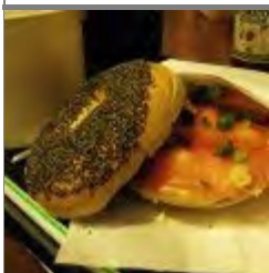
Brooklyn B Bagel Bakery and Café @

◀ Previous: Fabulous Father's Day Feasts