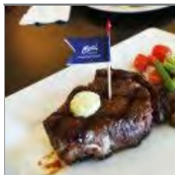
A 'STEAK UP' AT MARIA'S @