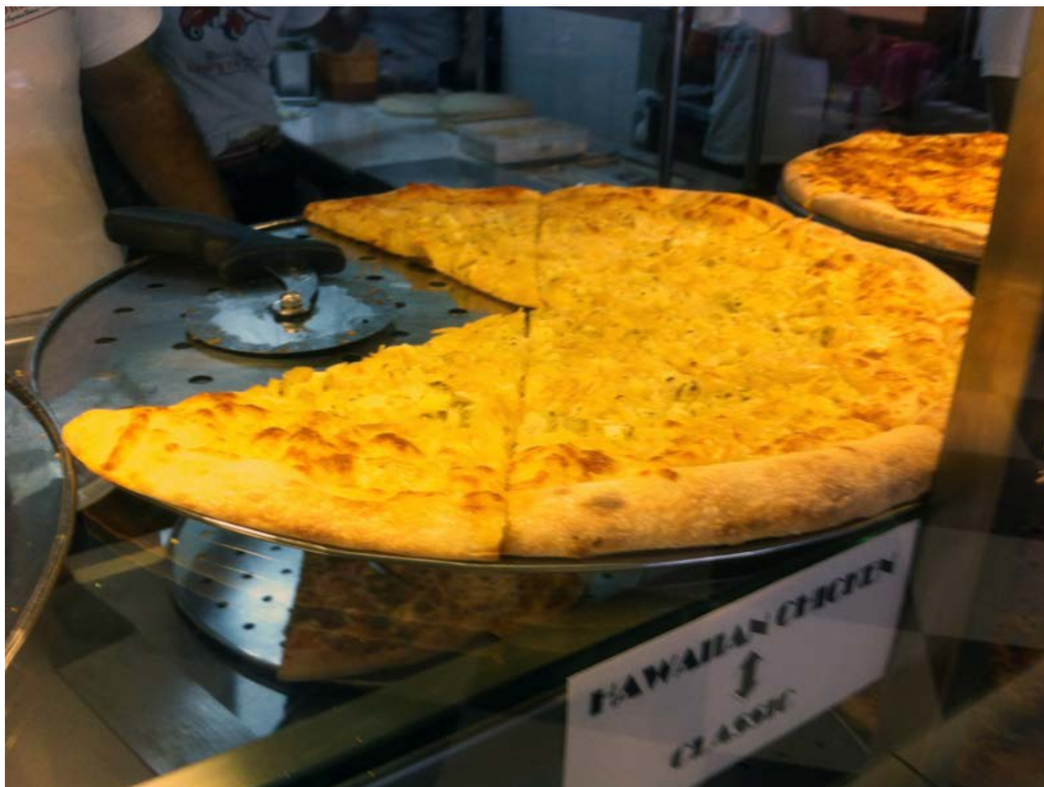
One size only – BIG!

The way it works here is you take a seat, peruse the menu, order, and pay upfront at the counter for your meal. Servers or Mikey himself will bring out the food to you with a smile. The walls are adorned with photos of people, things, and places reminiscent of all things American.