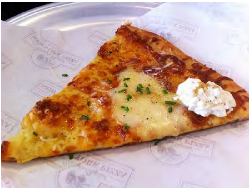
Pizza Bianco – the signature four-cheese pizza that will rock your world

The meatball pizza was decent but the pizza Bianco ('white' in Italian) was another pleasant surprise – mozzarella, ricotta, cheddar, and goat cheeses fused to perfection. We couldn't tell the cheeses apart and it didn't matter as the pizza was delicious.