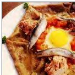
La Creperie de Caroline@Bangsar