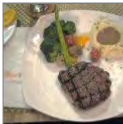
MEAT POINT @ TAMAN TUN