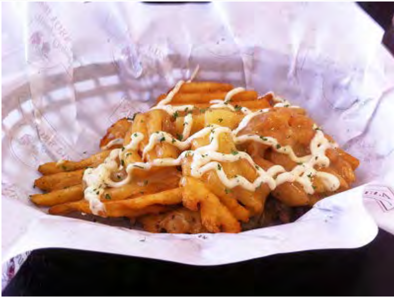
Manhattan waffle fries with steak slices and cheddar cheese

The boneless buffalo chicken wings (RM12.88) was definitely the star of our meal; the tender, spicy, and tangy bite-sized chicken pieces coated with Mikey's special sauce and blue cheese dip really made our taste buds sing in harmony.