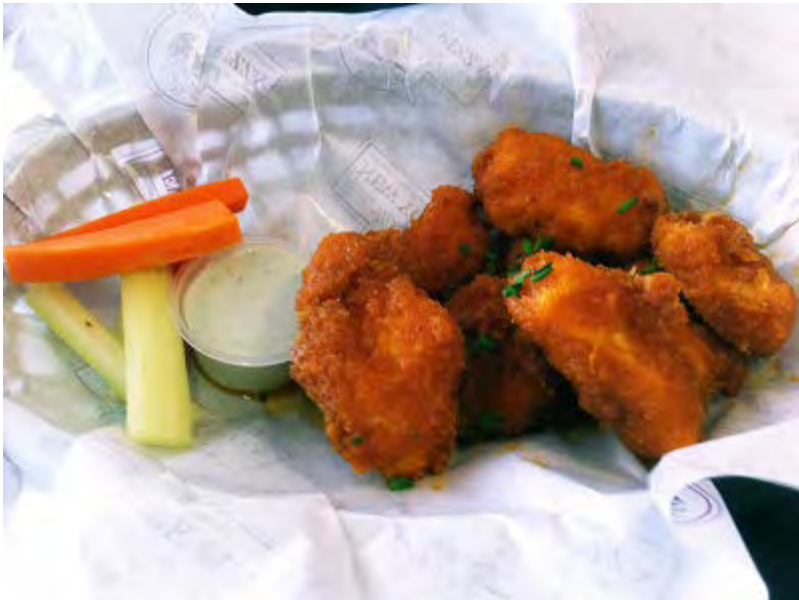
The boneless buffalo chicken wings were gobbled down too easily

The boneless buffalo chicken wings (RM12.88) was definitely the star of our meal; the tender, spicy, and tangy bite-sized chicken pieces coated with Mikey's special sauce and blue cheese dip really made our taste buds sing in harmony.