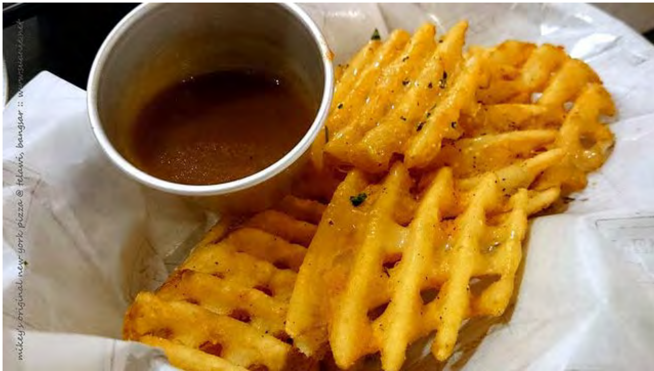
As advertised: crispy on the outside, fluffy on the inside

If you need more than pizza, Mikey's offers waffle fries (good), boneless buffalo chicken wings, nuggets and sandwiches. Budweiser is available... but why?