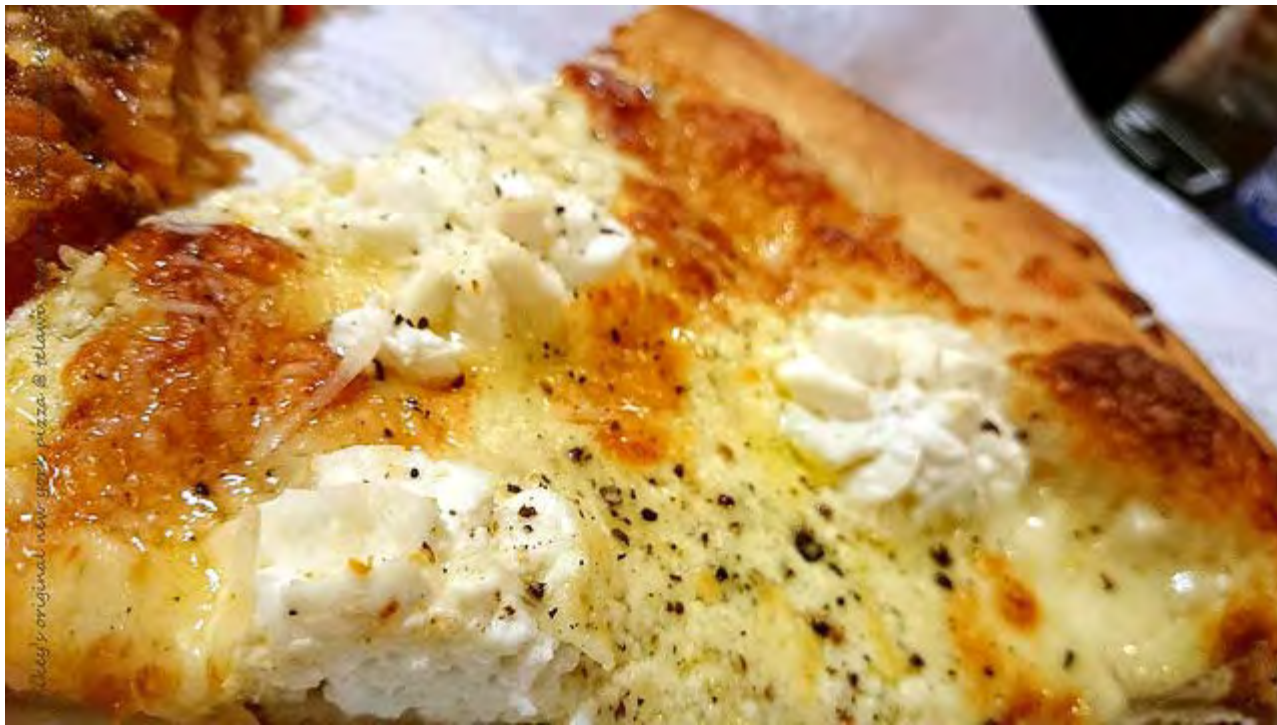
Four Cheese Heaven

Andrew's favourite (and now mine!) is Pizza Bianca aka 4-Cheese Pizza at RM10.88+ per slice. Get a load of cheddar, mozzarella, ricotta and goat's cheese, black pepper, olive oil and garlic. Rich and decadent, worth the calories!