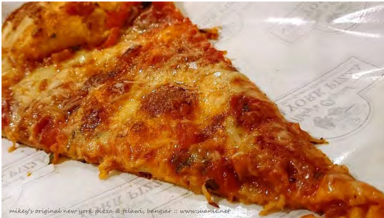
The Classic New York pizza