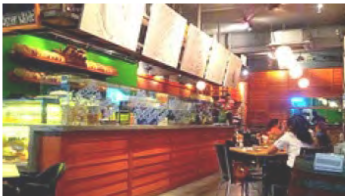
G3 Kitchen & Bar @ Bangsar In "Eating Out"