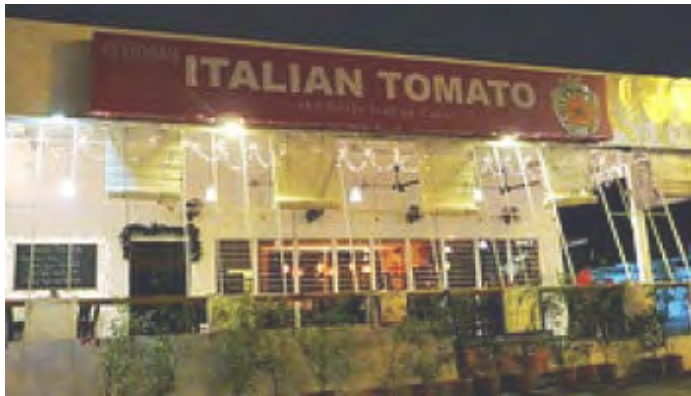
Italian Tomato @ Jalan Maarof, Bangsar In "Eating Out"

+ 8 comments filed under: eating out + tagged with: american pizza kuala lumpur , mikey's pizza bangsar , mikey's pizza delivery , new york pizza bangsar , new york pizza kuala lumpur