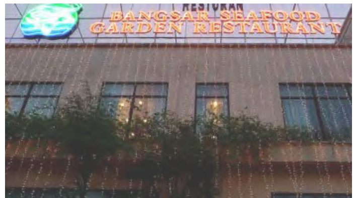
Fresh, succulent seafood (among other things) at Bangsar Seafood Garden Restaurant In "Eating Out"