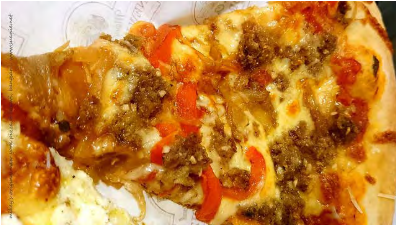
Meatballs Pizza aka Mikey's Favourite

Upgrades are available from RM12 onwards for waffle fries/ wings and a drink.