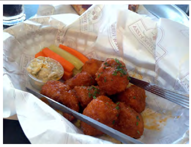
Boneless Buffalo Wing, oh fiery!!!