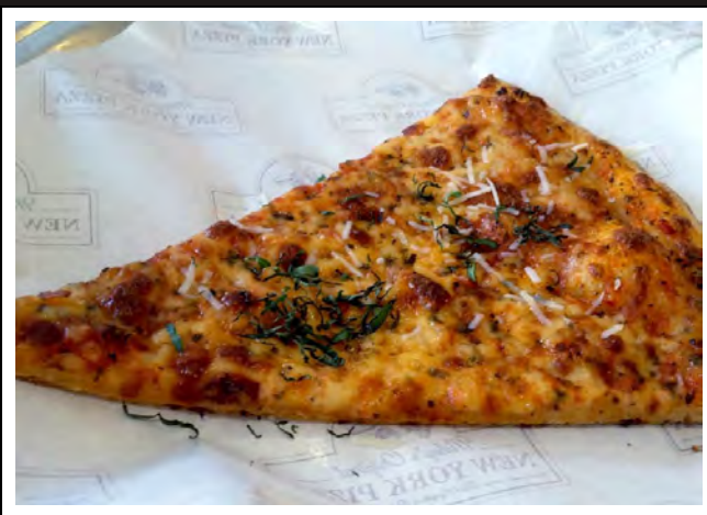
Classic New York Pizza, RM8.88.

In general, all pizzas we tried were quite satisfying with a thin crust which is crispy and nice to chew on. My personal favourite has to be the Tony Soprano, which comes with sliced steak, pepperoni and whole loads of other ingredients. It was tasty yet not as rich as what you would expect from the look of the pizza. I also appreciate the fact that they use big-ass Portobello mushrooms as their ingredients which makes their pizza a little more worthy of the price.