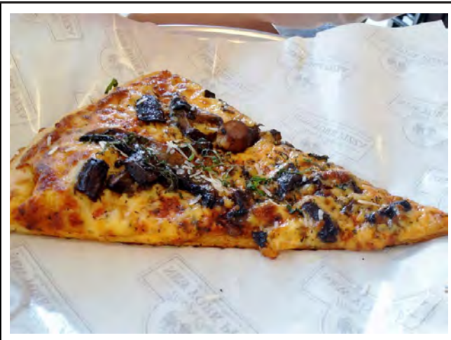
Wild Mushroom Pizza, RM10.88.