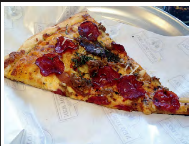
The Tony Soprano, RM15.88.