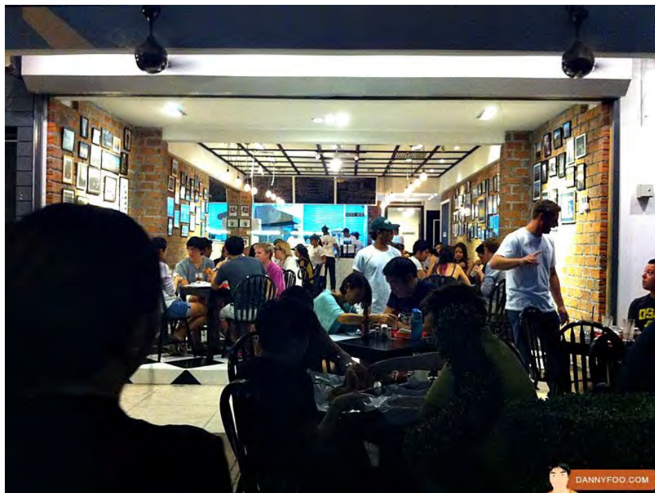
View from outside Mikey's Original New York Pizza

A couple of friends and us went over to a new pizza place in Bangsar called; Mikey's Original New York Pizza. Besides the usual horrid need to find a parking space along the Telawi road, a queue had already formed waiting for tables.